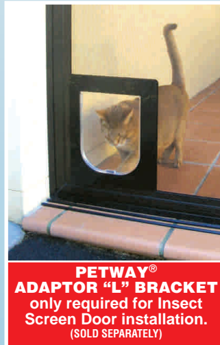
PETWAY® ADAPTOR "L" BRACKET only required for Insect Screen Door installation. (SOLD SEPARATELY)

The Petway® pet door may increase risk of theft or damage by an intruder or unwanted animal. The product is not to be fitted on any doors leading to a swimming pool. Petway® Access Doors and their agents will not be liable for any loss or damage caused by fitting and using their product.